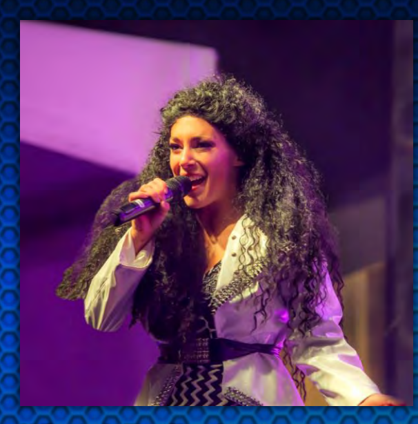
What A Feeling!