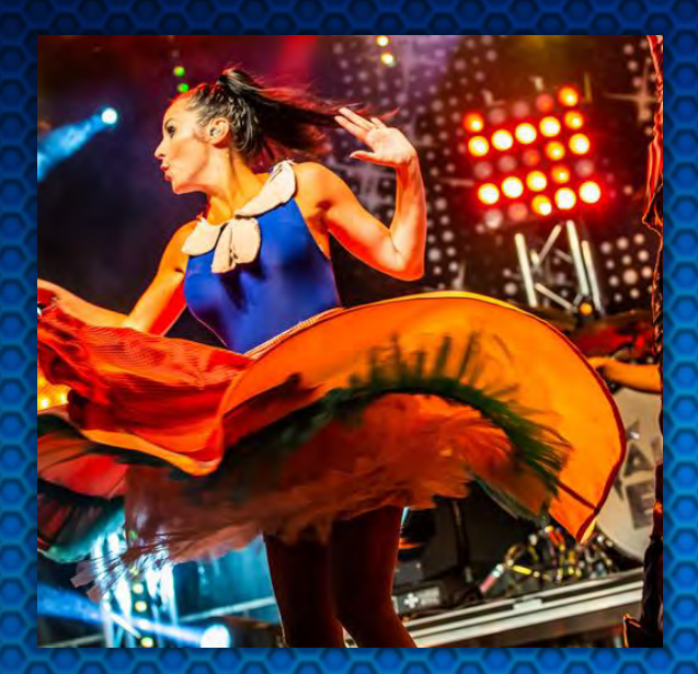
Do You Wanna Dance