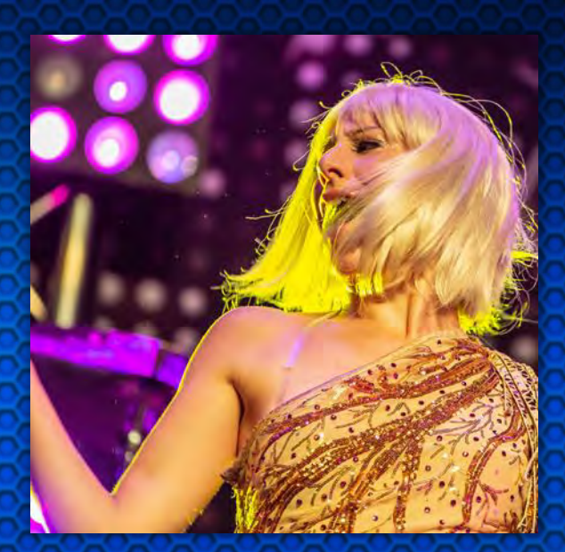
The Loco-Motion/ Vanilla Ice